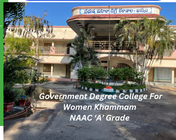
Government Degree College For Women Khammam NAAC ‘A’ Grade

Organised by Department of Physics Government Degree College For Women, Khammam